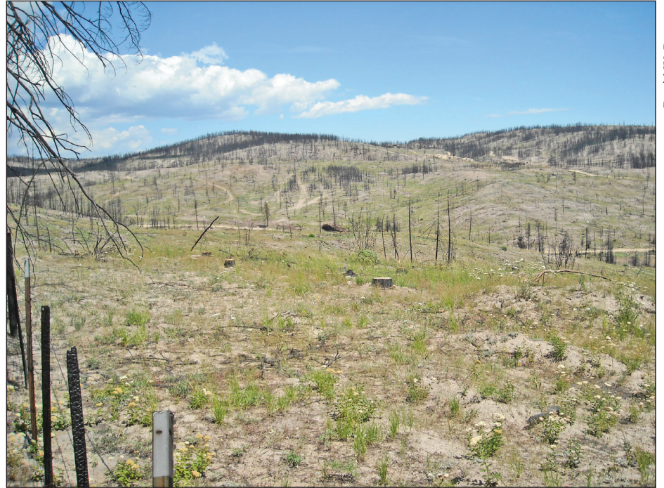
One year after postfire logging on a site that burned during the 2014 Carlton Fire in Washington.