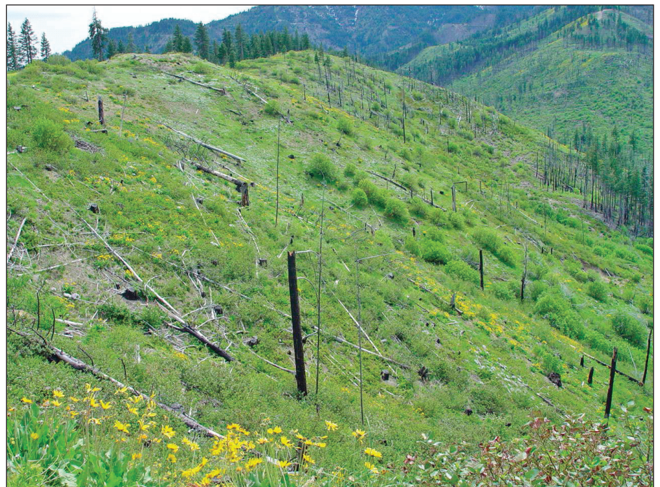
Fuels and vegetation recovery 10 years after high-severity wildfire and postfire logging following the 1994 Rat-Hatchery Fire near Leavenworth, Washington, in the Okanogan-Wenatchee National Forest.