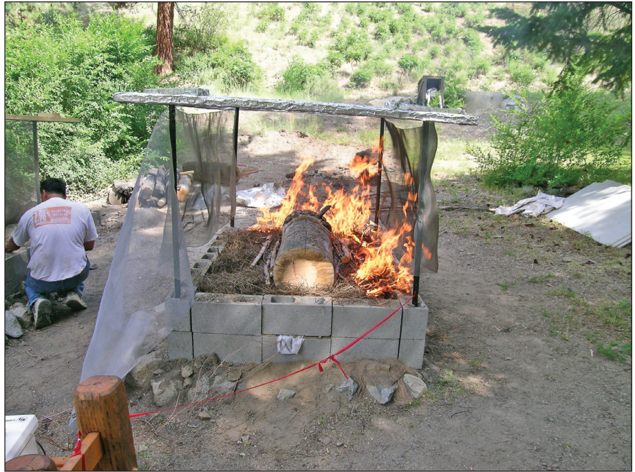
Researchers test how log size and state of decay affect soil heating. They found that rotten logs burned longer than the sound logs, leading to high soil temperatures and deeper soil heating.