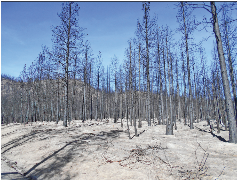
Dave W. Peterson

Standing dead trees in a high-severity patch burned in the 2015 Chelan Complex Fire on the Okanogan-Wenatchee National Forest. New research finds that postfire logging reduces future fuel loads, and when best management practices are used, minimally affects the regrowth of understory vegetation in dry forests east of the Cascade Range.