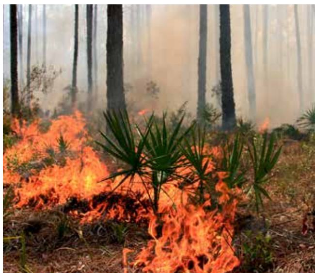
Flatwoods forest in Florida where fuels have been masticated.

“The GRIN funding enabled me to contribute the soils carbon component, which they wouldn’t otherwise have been able to do,” Godwin says. “I was able to add about a year of monthly measurements at that site, which came out to almost 3,000 individual measurements of soil temperature, moisture, and