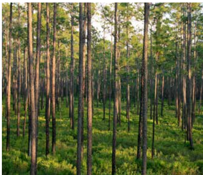
Green flatwoods forest in Florida.