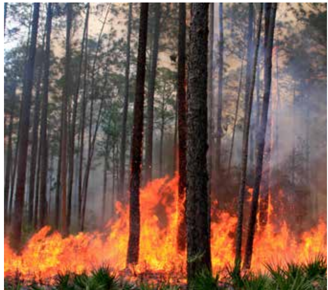
Burning flatwoods forest in Florida.