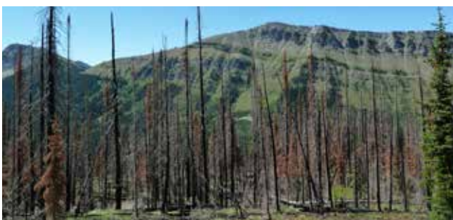
Forest in the northern Rockies where Brian Harvey studied burn-severity patterns.

useful information for probing deeper. A weak signal of changing patterns might be partly due to the very heterogeneity being examined—burn severity is highly variable to start with, and pattern changes might be expected to be subtle and hard to detect.