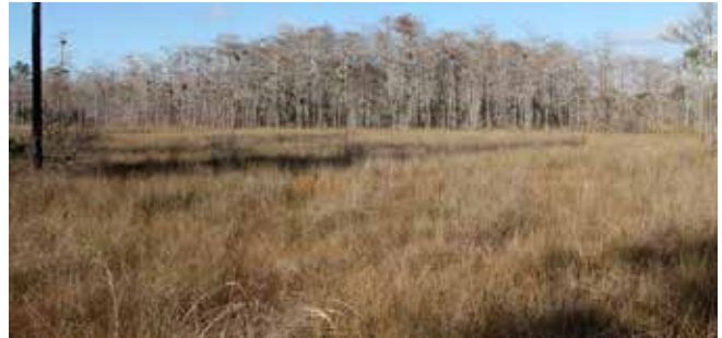
Florida cypress wetlands.

in Reno, Nevada, in the summer of 2013. “GRIN positioned me well to be in the right place at the right time,” he says.