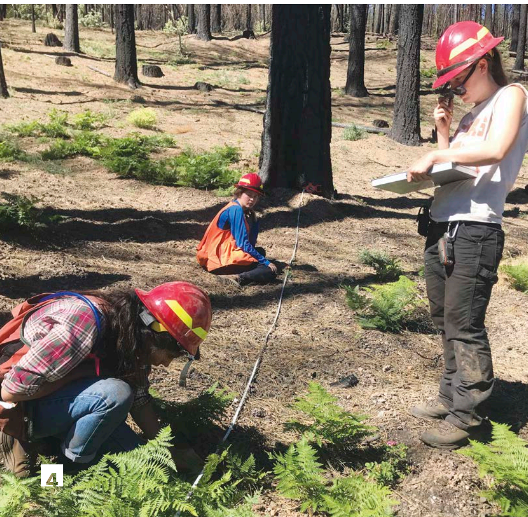
Field technicians document vegetation growing along a transect with a study plot in an area burned in the Mendocino Complex in 2020.

"We have heard from environmental groups and others that they want to see the Forest Service test and calibrate models such as the Forest Vegetation Simulator FVS system," Darner says. "We have this opportunity not only to test and calibrate our models, but also