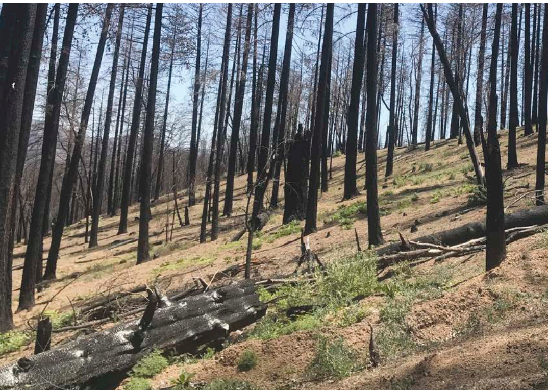
A small portion of the Mendocino National Forest, California, that burned during the 2018 Mendocino Complex.

A woodland in full color is awesome as a forest fire, in magnitude at least, but a single tree is like a dancing tongue of flame to warm the heart.