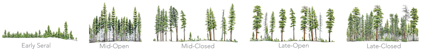
Structural classes. Illustrations adapted by Haugo et al. 2015 with permission from Van Pelt 2008.

In this study, researchers investigated the extent of forest restoration needed to move present day forests towards a NRV across fire-adapted landscapes in eastern Washington, eastern Oregon, and southwestern Oregon. They assessed forest vegetation restoration needs for over 28 million acres of forest based on the distribution of different forest types (e.g., Dry Mixed Conifer vs. Moist Mixed Conifer) and the current relative abundance of structural classes (see below) compared to NRV reference conditions. Using this approach, researchers determined which structural classes were overrepresented and underrepresented in each landscape unit. They then evaluated which of several different treatment or restoration categories ('Disturbance Only', 'Disturbance then Succession', and 'Succession Only') could transition acres to structural classes that would restore a distribution of classes to within the NRV reference conditions.