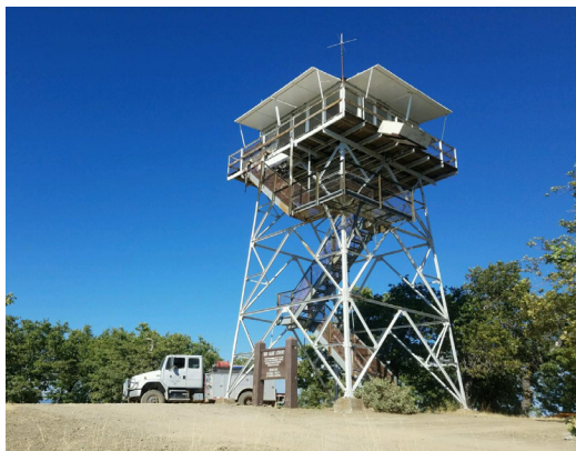
Engine on the Mad River Fire, CA. 2015.