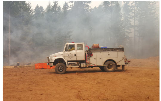
Engine on the Stouts Creek Fire, OR. 2015.

In this study, researchers used data from the US Forest Service's National Resource Ordering and Status System to investigate how private sector resources were dispatched to fires. In particular, they examined the dispatch of private engines in the Northwest Geographic Area (GA), which encompasses Oregon and Washington, from 2008 to 2015. The researchers also investigated how private sector engine capacity compared to demand by focusing on engine dispatch during the 2015 fire season, which was widely considered the most severe in the Northwest's modern history.