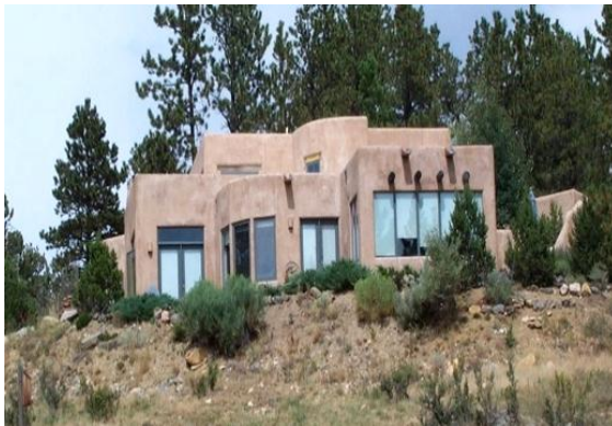
Home made of stucco