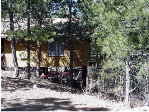
Homes WITHOUT defensible space