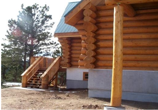
Home made of heavy timber