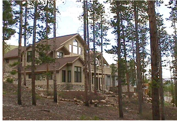
Homes WITH defensible space