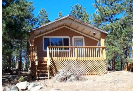
Home with enclosed deck