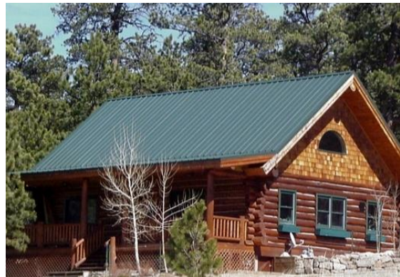
Home with aluminum roof

1. How familiar are you with firewise construction ? ( Circle one number )